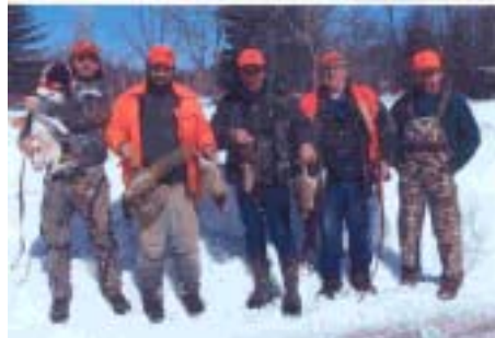
A Successful Hunt